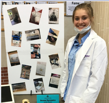
Students present their Senior Capstone projects at the Community Fair in the MHS Commons (from left, exploring sound engineering and the field of dentistry)